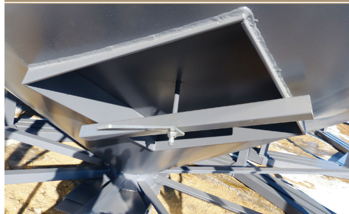
20" inspection port with secure latch