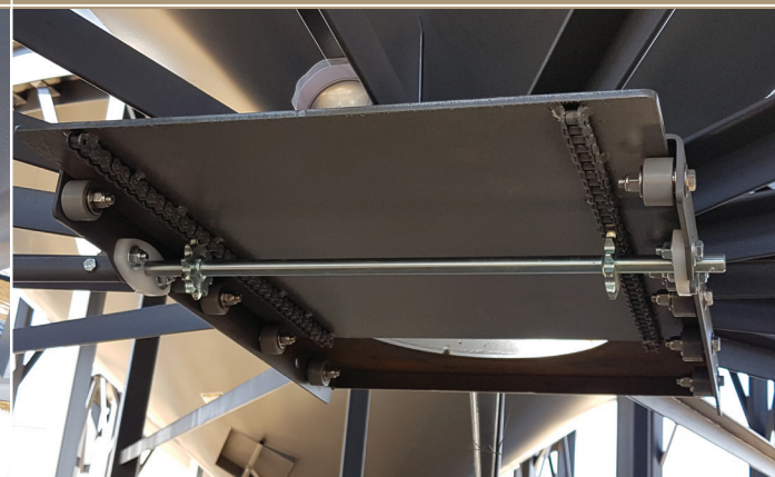
Rack and Pinion Gate