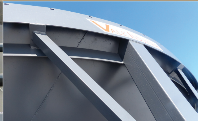
Heavy double ring and angle brace construction