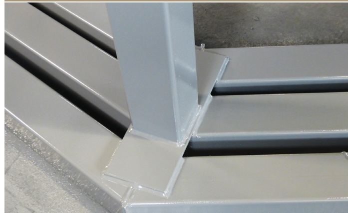
Triple skid base with heavy welded leg connection